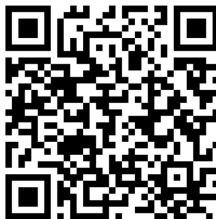
Getting around The City